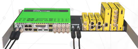
Power Supply connections