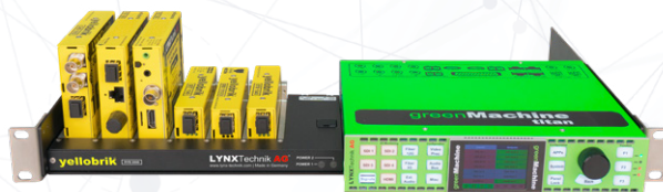
Six yellobriks and greenMachines setup