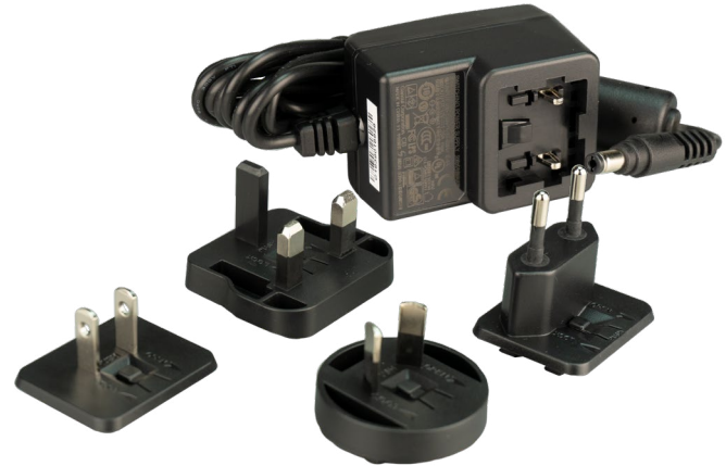
RPS 1001 with interchangeable wall plugs

The RPS 1001 AC/DC switching mode external wall plug power supply unit provides 15 watts of continuous output power. This power supply unit is meant to be used with a single yellobrik module.